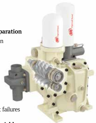
The all-in-one CE55X air end features improved air/oil separation and reliability.